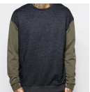
CREW NECK SWEATSHIRTS